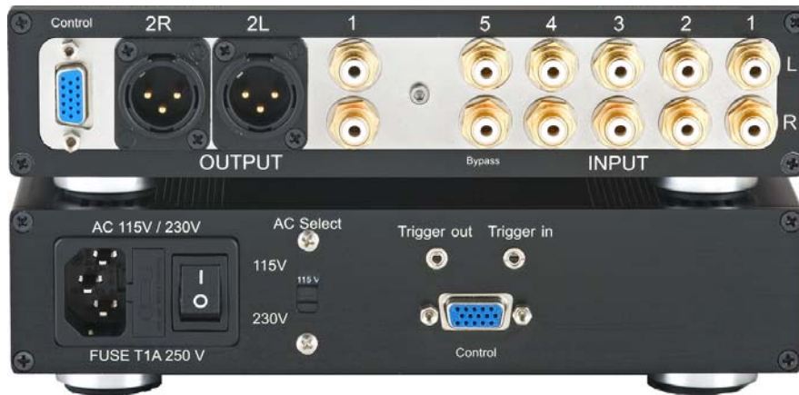
Figure 2 shows the connectors.