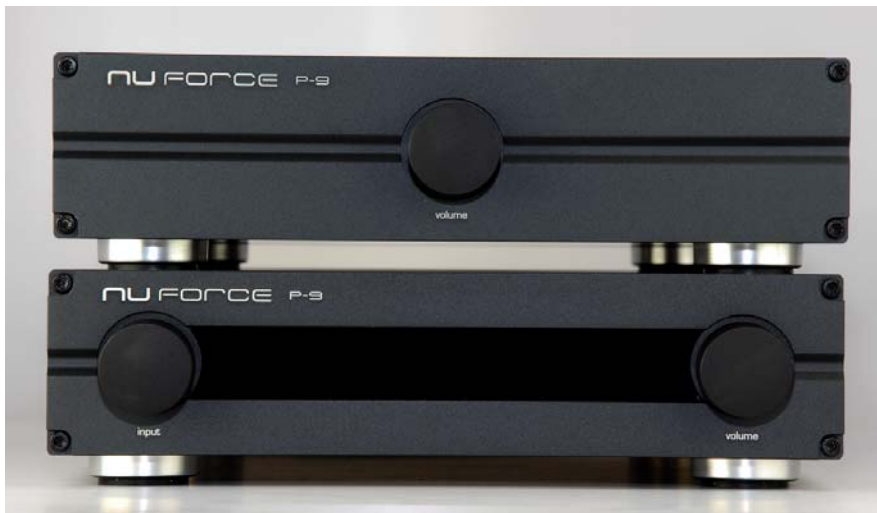
Figure 1 shows the Analog Box sitting on top of the Control Box.